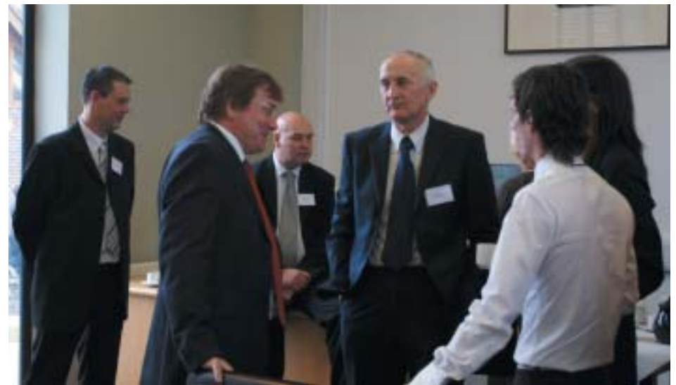
Businesses networking and exchanging ideas and views during coffee break