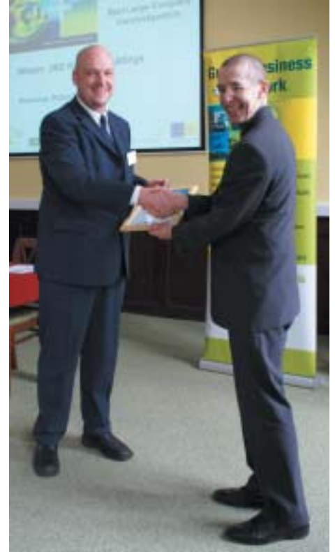
Best Large Company Cambridgeshire: JRD Rubber Mouldings