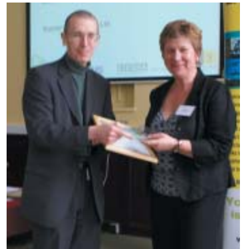
Best large company, Bedfordshire: Hain Celestial