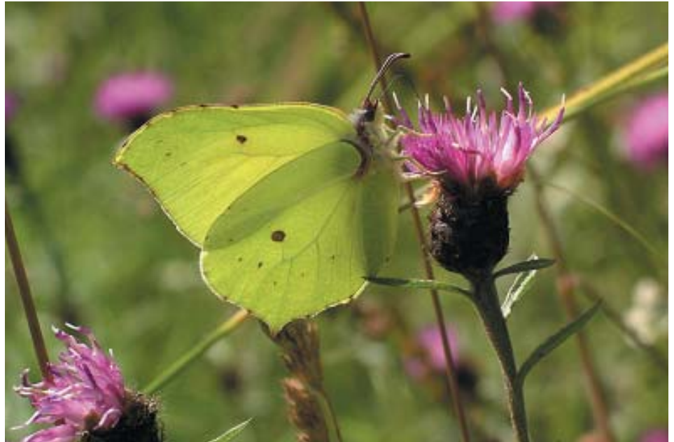
Brimstone butterfly on black knapweed

GrantScape, the national environmental grant-making charity based in Bedfordshire, will soon be launching a special grant programme to support nature conservation projects in Bedfordshire. This initiative is supported by Bedfordshire County Council and by "BedsLife - Biodiversity Forum for Bedfordshire and Luton".