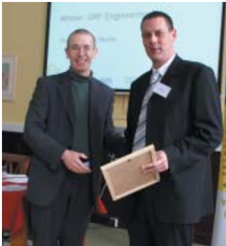
Best SME, Bedfordshire: GRF Engineering