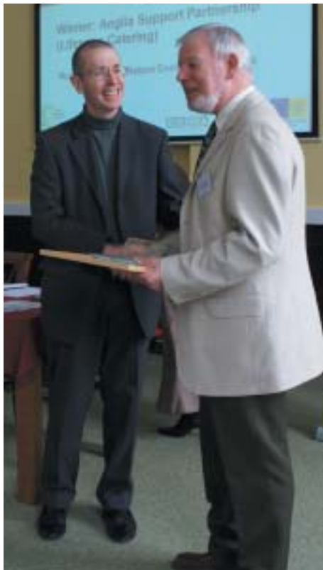
Best SME Cambridgeshire: LifeSpan Catering